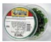
64120 Green Cherries