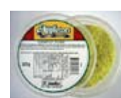
55206 Chicken Soup Base