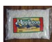
67251 - Coconut Sweetened Shred