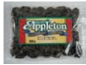
70132 Pitted Prunes