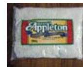
67252 - Coconut Unsweetened Medium