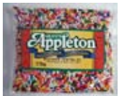
60222 Rainbow Sprinkles