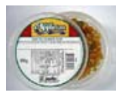
64235 Mixed Peel