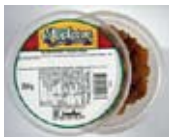
54523 Golden Raisins (tub)