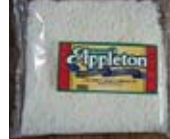
67254 - Coconut Sweetened Medium (Desicc)