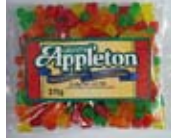
62808 Baking Gums