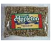
62556 Walnut Crumbs