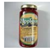
64250 Red Maraschino Cherries