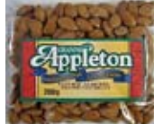
10200 Natural Almonds