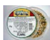
79104 Soup Mix (tub)