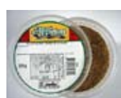
79030 Milled Flax Seed (tub)