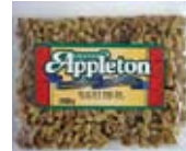
62553 Walnut Pieces