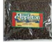
67159 Cookie Chips