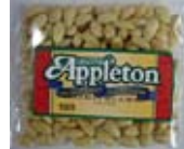
62018 Blanched Almonds Whole