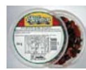
64215 Royal Baking Mix