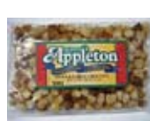
50571 Onion & Garlic Croutons