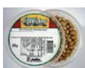
55280 Soya Nuts (tub)