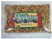
72311 Peanuts Salted