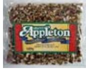
62394 Pecan Pieces