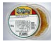
64240 Lemon Peel