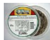
55204 Beef Soup Base