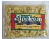
62006 Blanched Almonds Sliced