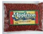
50520 Bacon Flavoured Bits