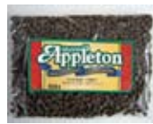
67156 Cookie Chips