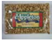
72312 Peanuts No Salt