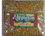
30076 Popping Corn