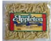
62010 Blanched Almonds Slivered