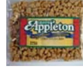
60101 Butterscotch Chips