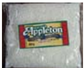
67256 - Coconut Unsweetened Medium