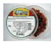
64210 Royal Baking Mix