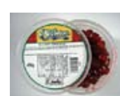
64115 Red Cherries