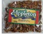
62390 Pecan Halves