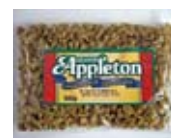
62554 Walnut Pieces