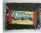
60107 Chocolate Chips