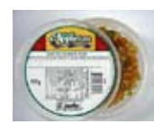
64230 Mixed Peel