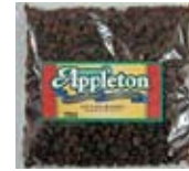
44514 Sultana Raisins