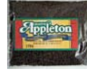
60220 Chocolate Sprinkles