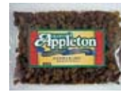
44513 Sultana Raisins