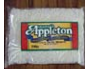
67250 - Coconut Sweetened Medium (Desicc)