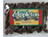
60210 Dates Pitted