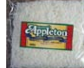
67255 - Coconut Sweetened Shred