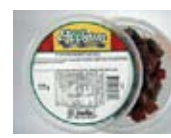
64330 Pineapple Wedges Assorted