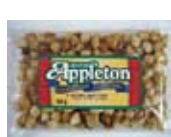
50565 Caesar Croutons