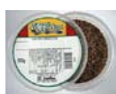
99025 Flax Seed