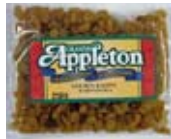
44523 Golden Raisins