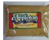
60520 Graham Cracker Crumbs