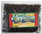
60160 Thompson Raisins