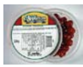
64110 Red Cherries