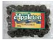
70134 Breakfast Prunes