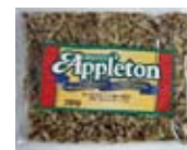
62555 Walnut Crumbs