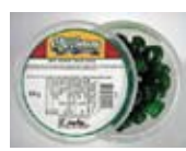
64125 Green Cherries