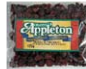
33025 Cranberries Dried